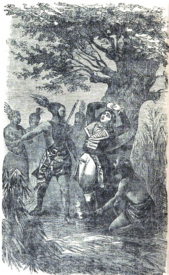
THE INDIAN MASON.