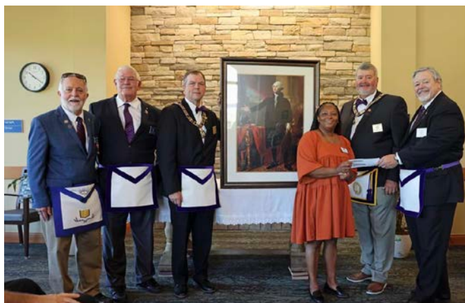
Presented $3,000 donation to Florence Veterans Village for residents to attend off campus activities. A Picture of George Washington was also presented.