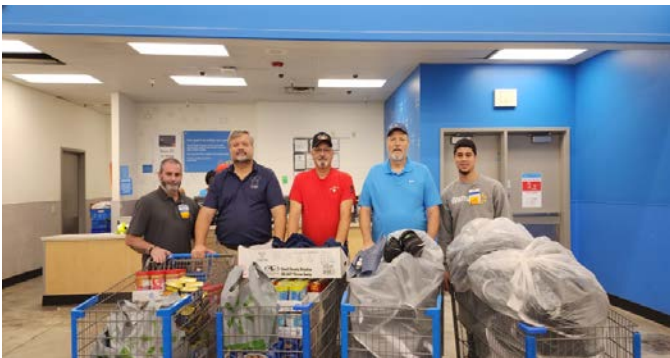
Food, and personal items purchased and donated to the Ralph H. Johnson Veterans Hospital in Charleston, SC.

SPECIAL COMMUNICATION, SATURDAY, FEBRUARY 10, 2024: For the purpose of laying the Cornerstone and dedicating and consecrating the new Lodge Hall of Blythewood Lodge No. 395. Lunch will be served at the Lodge at 11:30 am. The Grand Master, with the assistance of the Grand Lodge Officers, will open the Grand Lodge and Blythewood Lodge No. 395 on the First Degree at 12:30 pm. The Cornerstone Laying Ceremony should begin at 1:00 pm with the Lodge Hall Consecration and Dedication Ceremony following and is open to the public. Blythewood Lodge's new Lodge Hall is located at 245 Adams Road, Blythewood, SC 29016.