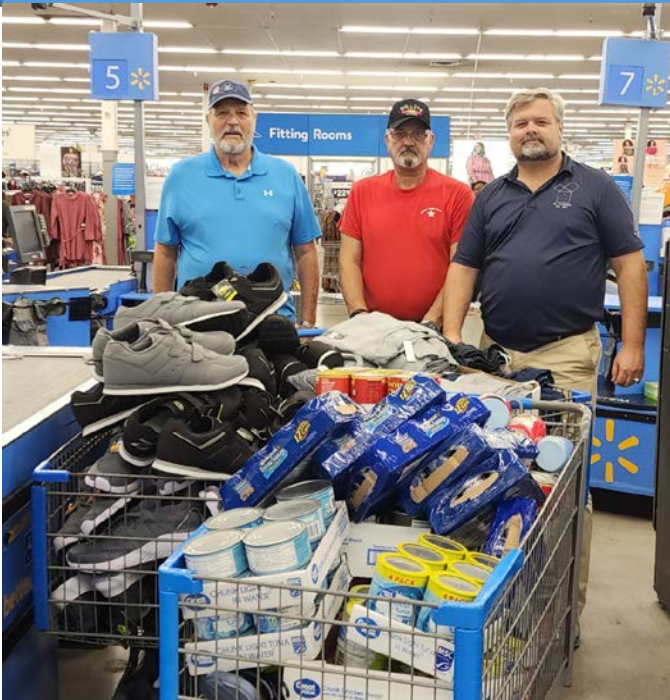
Food, and personal items purchased and donated to the Ralph H. Johnson Veterans Hospital in Charleston, SC.