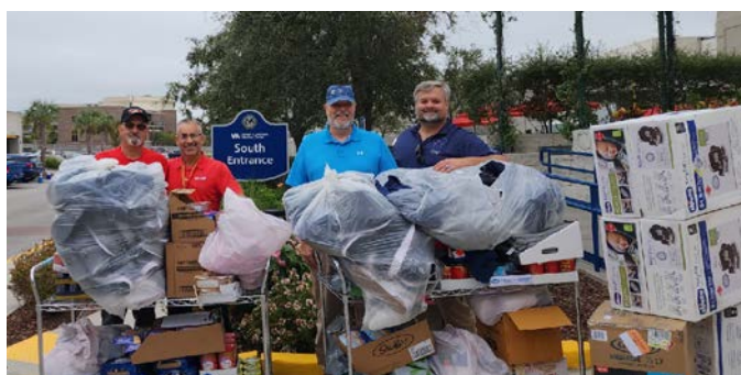
Food, and personal items purchased and donated to the Ralph H. Johnson Veterans Hospital in Charleston, SC.