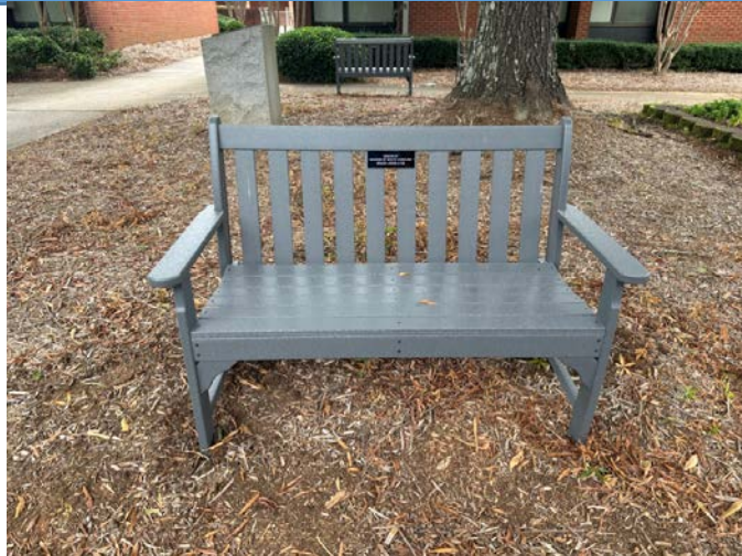
A total of 6 benches were purchased and installed at Richard Michael Campbell's Nursing Home Courtyard in Anderson, SC.