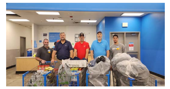
Food, and personal items purchased and donated to the Ralph H. Johnson Veterans Hospital in Charleston, SC.

FECIAL COMMUNICATION, SATURDAY, FEBRUARY 10, 2024: For the purpose of laying the Cornerstone and dedicating and consecrating the new Lodge Hall of Blythewood Lodge No. 395. Lunch will be served at the Lodge at 11:30 am. The Grand Master, with the assistance of the Grand Lodge Officers, will open the Grand Lodge and Blythewood Lodge No. 395 on the First Degree at 12:30 pm. The Cornerstone Laying Ceremony should begin at 1:00 pm with the Lodge Hall Consecration and Dedication Ceremony following and is open to the public. Blythewood Lodge's new Lodge Hall is located at 245 Adams Road, Blythewood, SC 29016.